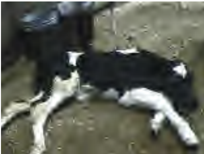
HSUS footage revealed shocking abuses.

Meanwhile, the on-site USDA inspector certified animals who could barely stand as fit for slaughter, stood by while a calf was skinned alive, and “never made one complaint, no matter how brutal the treatment,” says the investigator. When shown the shocking images, the USDA and the Vermont Agency of Agriculture ordered the plant's immediate shutdown. The HSUS is now pushing the USDA to go a step further and close a regulatory loophole allowing slaughter of downer calves too ill or hurt to stand on their own.