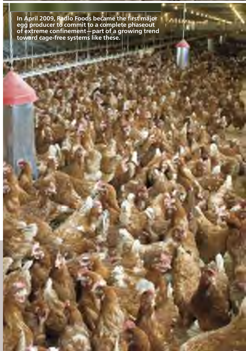
In April 2009, Radlo Foods became the first major egg producer to commit to a complete phaseout of extreme confinement—part of a growing trend toward cage-free systems like these.