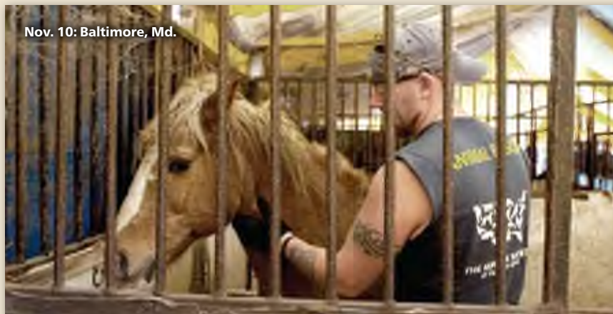
Nov. 10: Baltimore, Md.