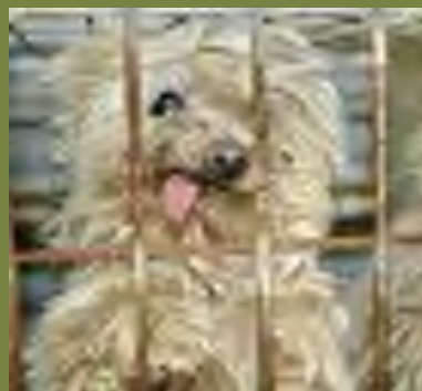
Nilla, another Maltese rescued from the North Carolina raid, was so depleted of nutrients that she had no teeth left to hold her dangling tongue in place.

As The HSUS continues to unite the animal welfare movement against those who value profit over compassion, we are determined to win the decades-old fight on behalf of our best friends. They deserve no less.