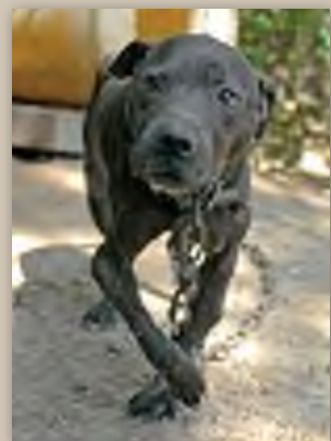
June 1: Randolph County, Ala.