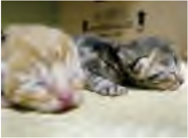
Ten of 12 kittens born during the rescue operation have now been adopted.