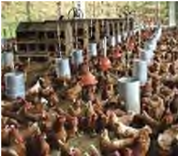
Hens are free from cages at this facility in Brazil, one of many countries where HSI works with local organizations to push for higher animal welfare standards.

As Western diets become increasingly popular in developing nations, factory-style agricultural practices are also proliferating. In India, more than 200 million hens confined in battery cages produce 80 percent of the country's eggs. But consumers still believe their eggs are "coming from some chicken running around in a village," says HSI campaigns manager Chetana Mirle.