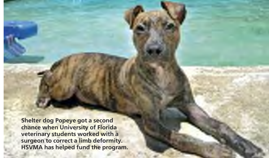
Shelter dog Popeye got a second chance when University of Florida veterinary students worked with a surgeon to correct a limb deformity. HSVMA has helped fund the program.