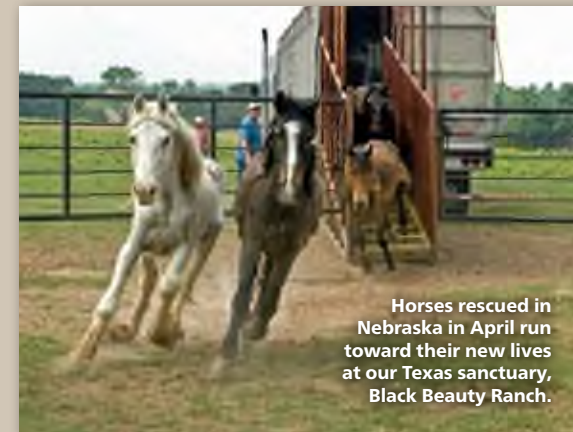
Horses rescued in Nebraska in April run toward their new lives at our Texas sanctuary, Black Beauty Ranch.