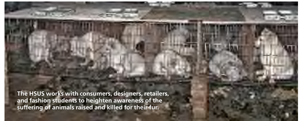
The HSUS works with consumers, designers, retailers, and fashion students to heighten awareness of the suffering of animals raised and killed for their fur.

But other companies have gotten the message. JCPenney, one of several retailers at the center of our 2006 investigation into fur labeling and advertising, became the first traditional department store to end all fur sales. In response to our lawsuits, Lord & Taylor and Andrew Marc agreed to phase out raccoon dog fur from U.S. stores. And by early 2010, Saks Incorporated, Bloomingdale's, and Macy's had agreed to endorse federal legislation to close a loophole that now allows many fur-trimmed items to be sold without proper labels. Saks and Bloomingdale's also committed to strict new garment labeling and advertising policies to help consumers make more humane choices.