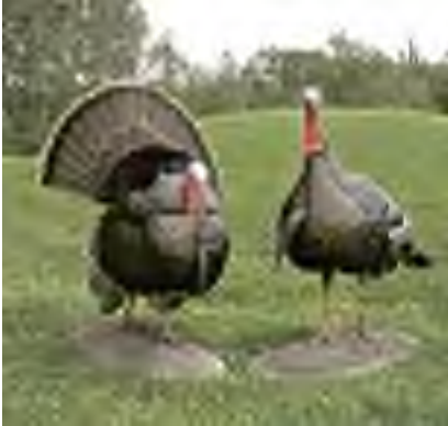
High-tech decoys like these help state agents catch poachers.

For the Oregon State Police Fish and Wildlife Division, the job got a little easier in October 2009, when a robotic elk donated by