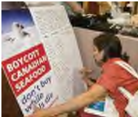
At our annual Taking Action for Animals conference, advocates learn about everything from protesting the Canadian seal hunt to ending dog chaining.

Though their roles in animal protection are very different, Lewis and Katz exemplify the value of investing in the people on the front lines of the humane movement. From our annual conferences and training workshops to our academic programs and Lobby Days, The HSUS educates and empowers new and seasoned advocates. Through our Student Outreach programs, we cultivate the movement’s future leaders—our way of ensuring that the animals will always have powerful voices on their side.