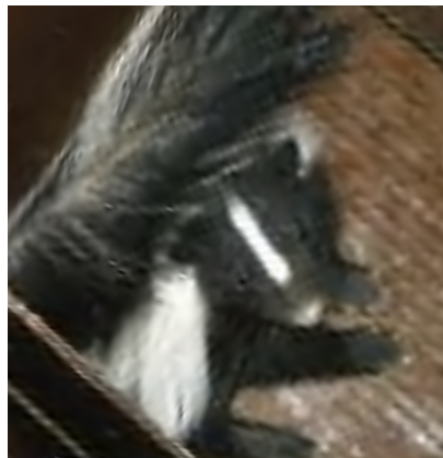
Humane Wildlife Services staff have helped this skunk and thousands of other animals.

It was all in a day’s work for HWS, which has helped about 4,000 animals in its first three years of operation—freeing squirrel families from attics, reuniting baby raccoons with their mothers, and removing possums trapped behind gutters. To keep animals from coming back, HWS also advises homeowners on the use of chimney caps, vent covers, and other prevention methods.