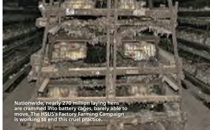
Nationwide, nearly 270 million laying hens are crammed into battery cages, barely able to move. The HSUS's Factory Farming Campaign is working to end this cruel practice.

2009 Impact: 2 state laws passed to free farm animals from extreme confinement in Michigan and Maine / 10 million animals per year to be helped by the Michigan law / Slaughter of downed adult cows banned through federal regulation / 1.8 million dairy cows in California to be protected from tail docking / 100 educational and corporate commitments made to improve welfare purchasing policies / 5 shareholder resolutions filed to improve conditions for farm animals