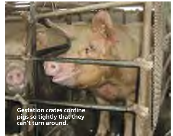
Gestation crates confine pigs so tightly that they can't turn around.