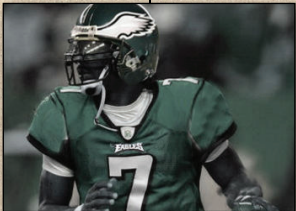
August 13, 2009 Philadelphia Eagles sign Vick