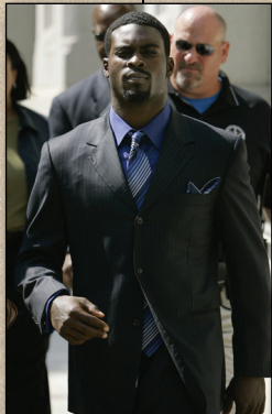
August 24, 2007 Vick files papers to plead guilty to conspiracy charges