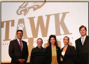
October 2009 Eagles launch "Treating Animals With Kindness" program that gives HSUS $50,000 "grant"