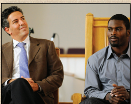
December 15, 2010 Wayne Pacelle tells an Atlanta Journal-Constitution reporter that Michael Vick "would do a good job as a pet owner"