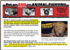
July 18, 2007 HSUS fundraises on the promise to "care for" Vick's dogs.