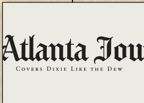
May 12, 2011 The Atlanta Journal-Constitution reporter states that "We have not corrected the story nor have we had any requests to correct it."

The Humane Society of the United States has a controversial history with convicted dogfighting kingpin Michael Vick. When Vick was initially indicted, HSUS exploited the case to raise money under questionable circumstances. And more disturbing, HSUS has since partnered with Vick, with HSUS president Wayne Pacelle even saying Vick would be a good pet owner.